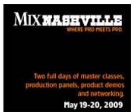
Nashville Programming Announced!

WHO WE ARE Distributed in 94 countries, Mix is the world's leading magazine for the professional recording and sound production technology industry. Mix covers a wide range of topics including: recording, live sound and production, broadcast production, audio for film and video, and music technology.